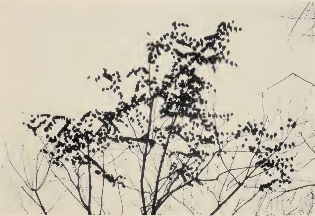
FIG. 15. A count made from the negative of this picture reveals about 1,000 Starlings in the top of this sycamore tree on Pennsylvania Avenue, Washington. The photograph was taken before sunrise.